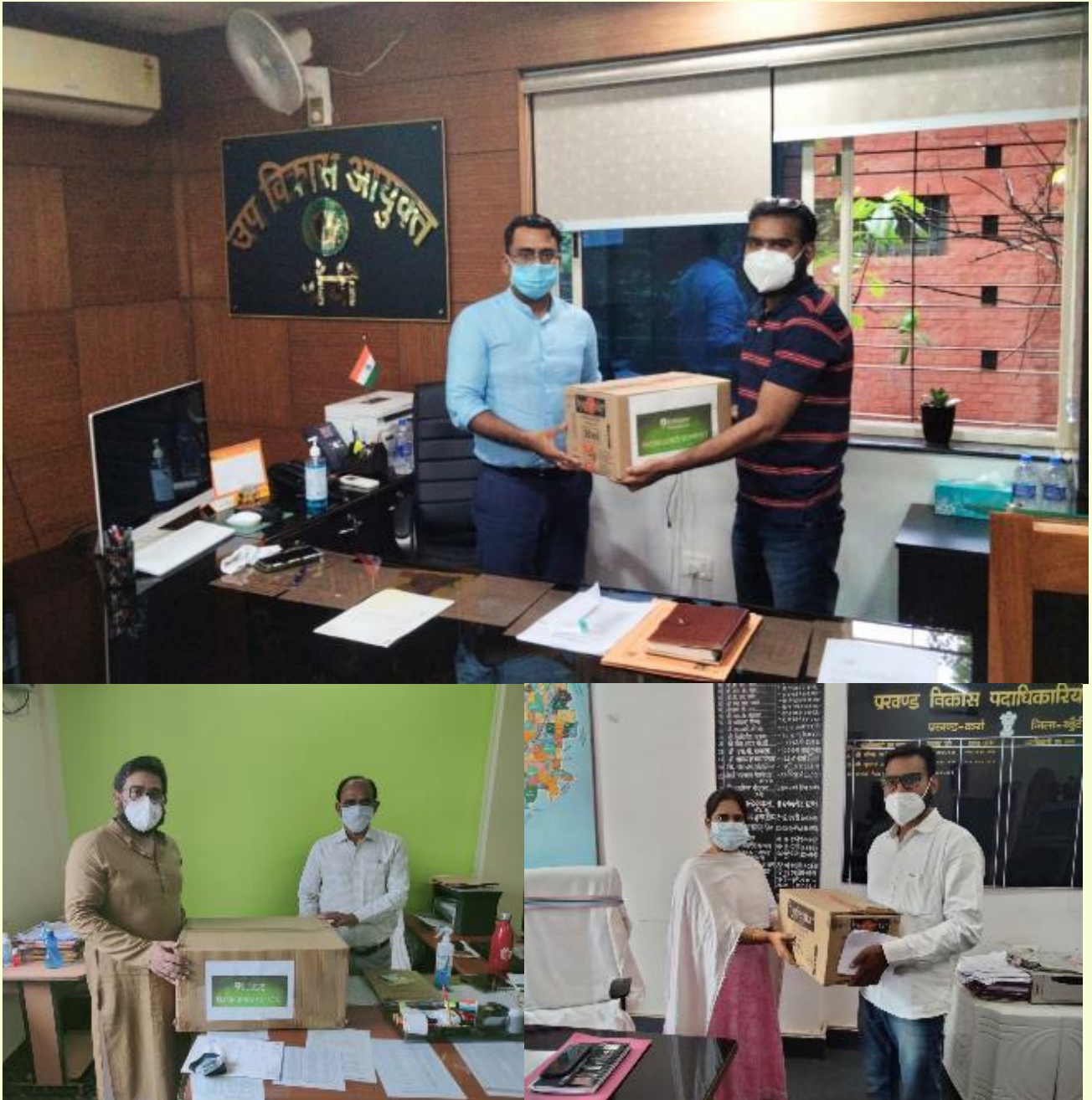
Masks & Sanitizers handed over to district and block administration, Ranchi and Khunti