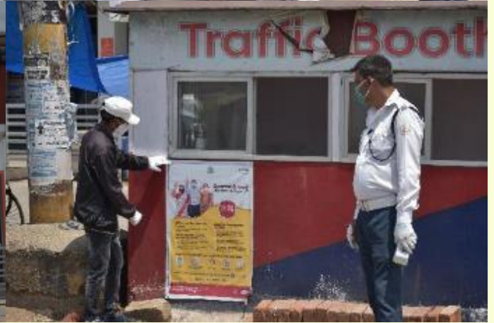
Mask distribution and mask wearing campaign