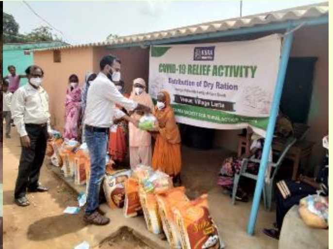
Distribution of dry ration