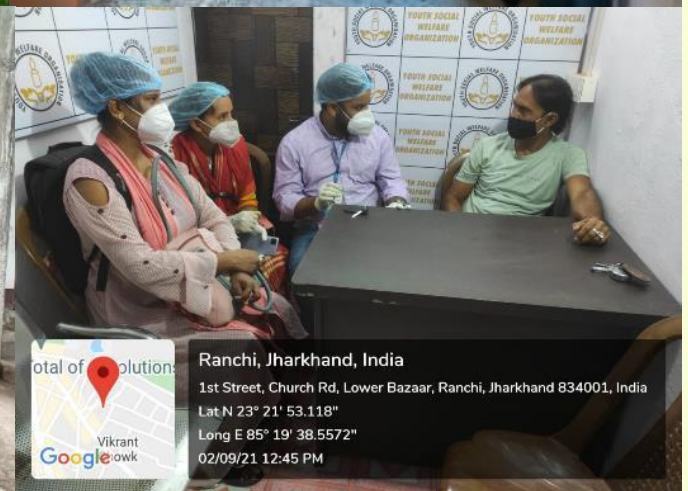
Meeting with local organizations