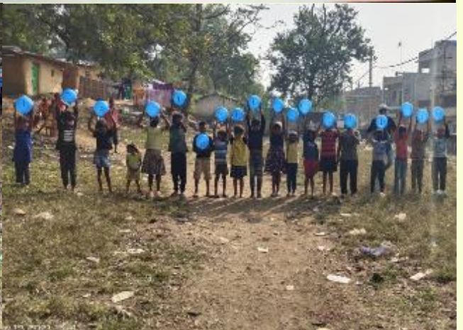
Children day celebrations