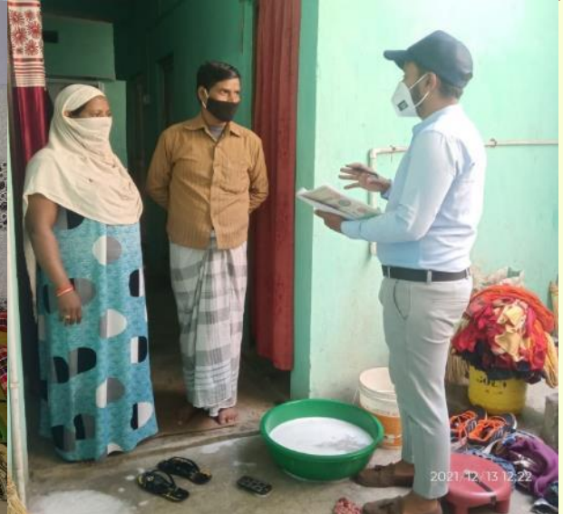
Community mobilization through community meetings and house to house visits